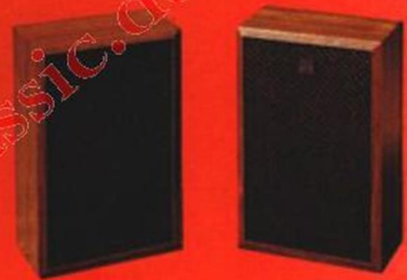
SS-110 —A compact 2-way speaker system, styled in walnut grain finish.