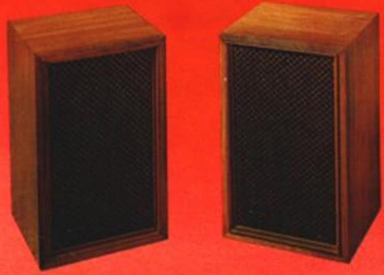
SS-510 —A 2-way speaker system with separate 8" woofer and 2" tweeter for smooth, wide-range sound. Speakers may be placed vertically or horizontally.