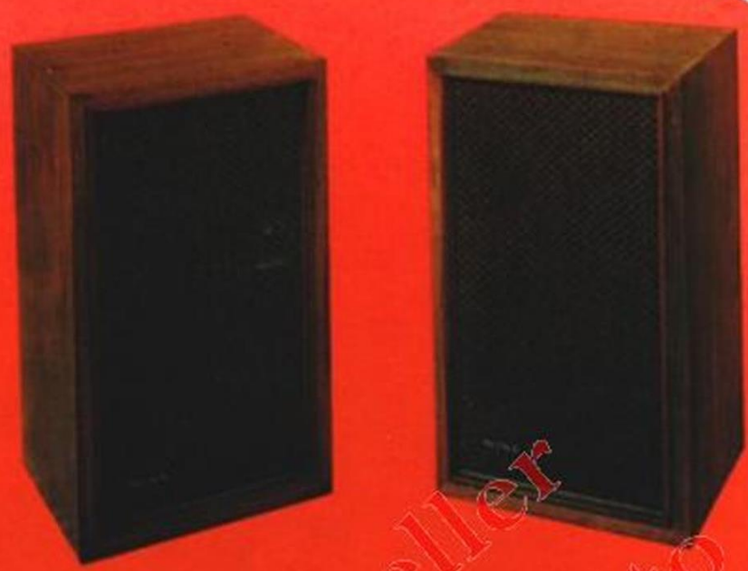
SS-613 —Our new 3-way speaker system with a separate speaker for each portion of the frequency spectrum. Each speaker contains an 8" woofer, plus a 4" mid-range and 2" tweeter.