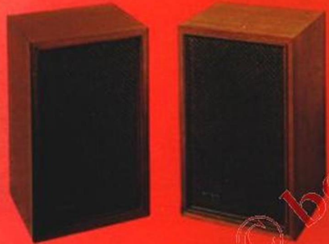
SS-210 —This 2-way speaker system has a 6½" woofer and a 2" tweeter for clear, clean sound. Speakers may be placed vertically or horizontally.