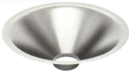
Polypropylene woofer cone. Ideally light, stiff and acoustically inert, it can act as a virtually perfect piston, and without producing internal forms of distortion found in paper cones.

The RS e also incorporates another first in Infinity's years-ahead technology: our RS woofer with an eight-inch cone of polypropylene.