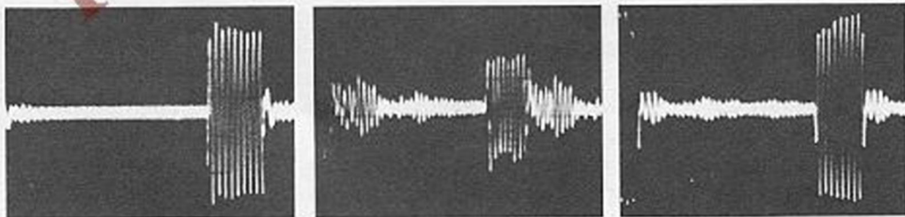
Tone-burst response of the Infinity 2000A, shown at (left to right) 100, 3,000, and 8,000 Hz, was generally excellent. The apparent ringing at 3,000 Hz is believed to be due to measurement difficulties.

Our own experience confirms the manufacturer's recommendation for the associated amplifier. Some medium-price receivers and amplifiers, in the 25- to 30-watt-per-channel range, produced dismal sound when driving this system, and their overload protection circuits often tripped. The 2000A is quite inefficient, but when driven by a really good 50- or 60-watt-per-channel amplifier, the results can be described conservatively as truly impressive.