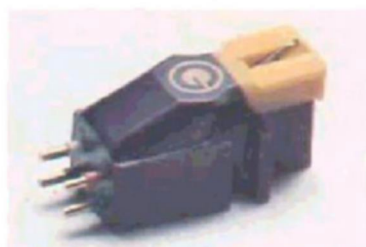
820 Super 'E'

well-screened against hum and have easily replaceable stylus systems. All have standard 1/2" fixing centres.