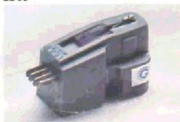
CS 91 E