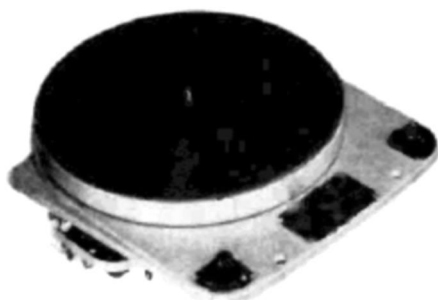
Fig. 6. Garrard 301 Transcription Turntable.