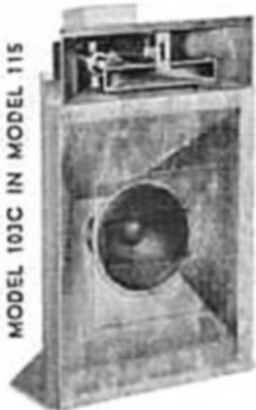
MODEL 103C IN MODEL 115

ELECTRO-VOICE, INC. BUCHANAN, MICHIGAN BULLETIN No. 220 PART No. 53223 PRINTED IN U.S.A.