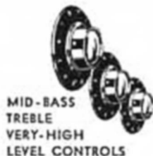
MID-BASS TREBLE VERY-HIGH LEVEL CONTROLS

Realizing that the Patrician will be played only at those levels permissible in the living room of the average user, a careful compensation has been made for the sensitivity of the human ear when high orchestral volumes are played back at the lower living room levels. In order to balance the Patrician perfectly to the acoustics of the room and the listeners' taste, three controls are provided. These controls adjust the Very-High, Treble and Mid-Bass ranges to the Low-Bass section, permitting complete compatibility to any room size or condition. The result is a naturalness of reproduction unparalleled in the art today.