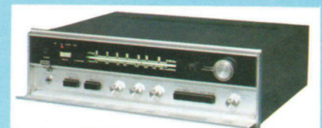
Try TA-7700 for use with BX-1200E System