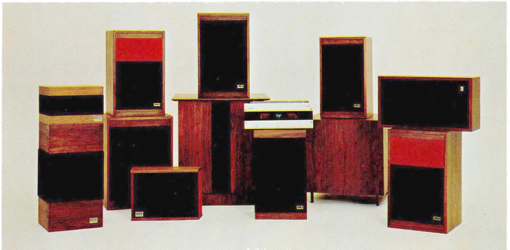
The Cerwin-Vega residential speaker line consists of over 15 models ranging in price from $79.50 to $995.00. All use High Energy components of our own manufacture to achieve the best reproduction that the state of the art permits. Other hi-fi products include the most powerful stereo amplifier ever designed for home use.