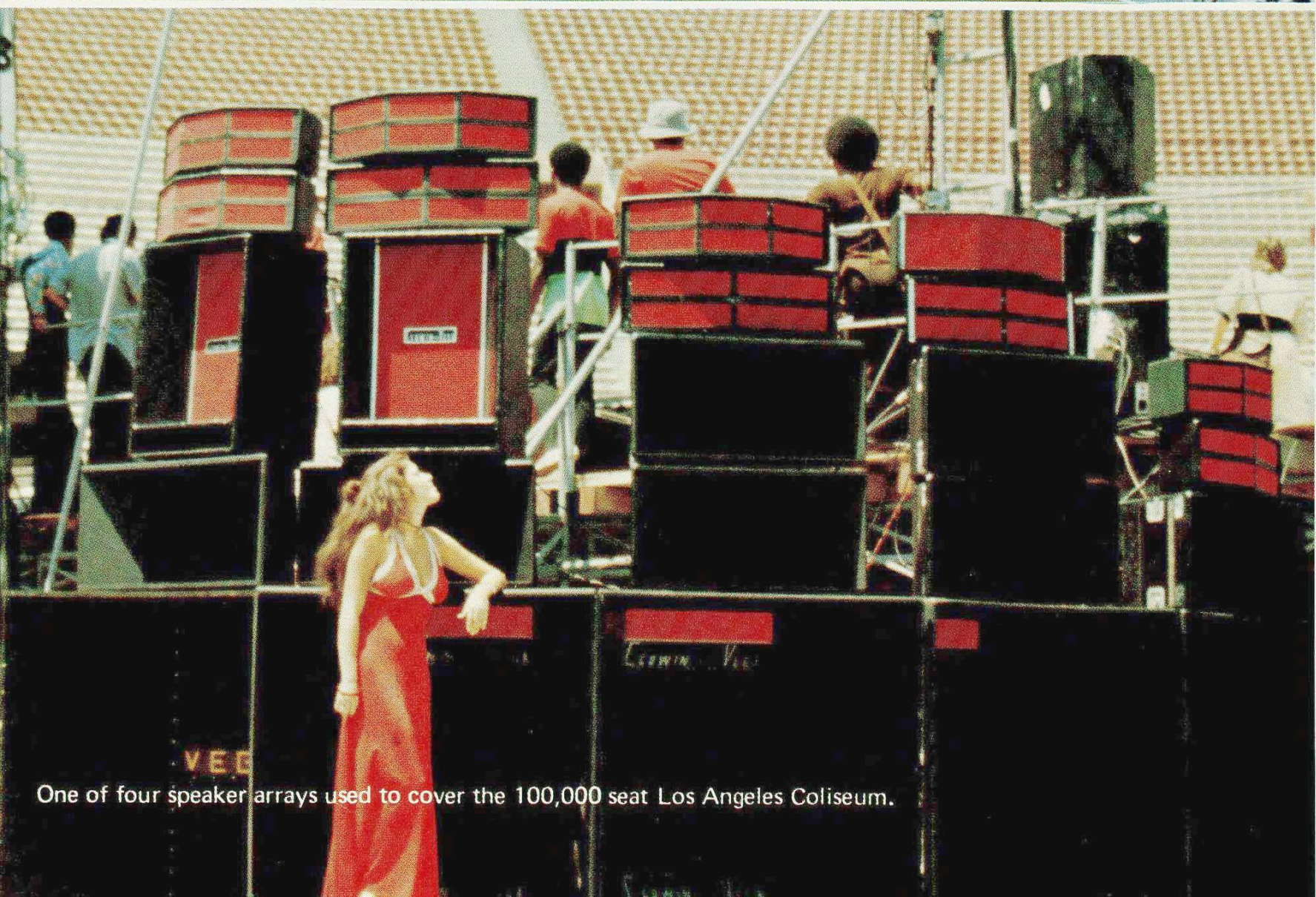
One of four speaker arrays used to cover the 100,000 seat Los Angeles Coliseum.