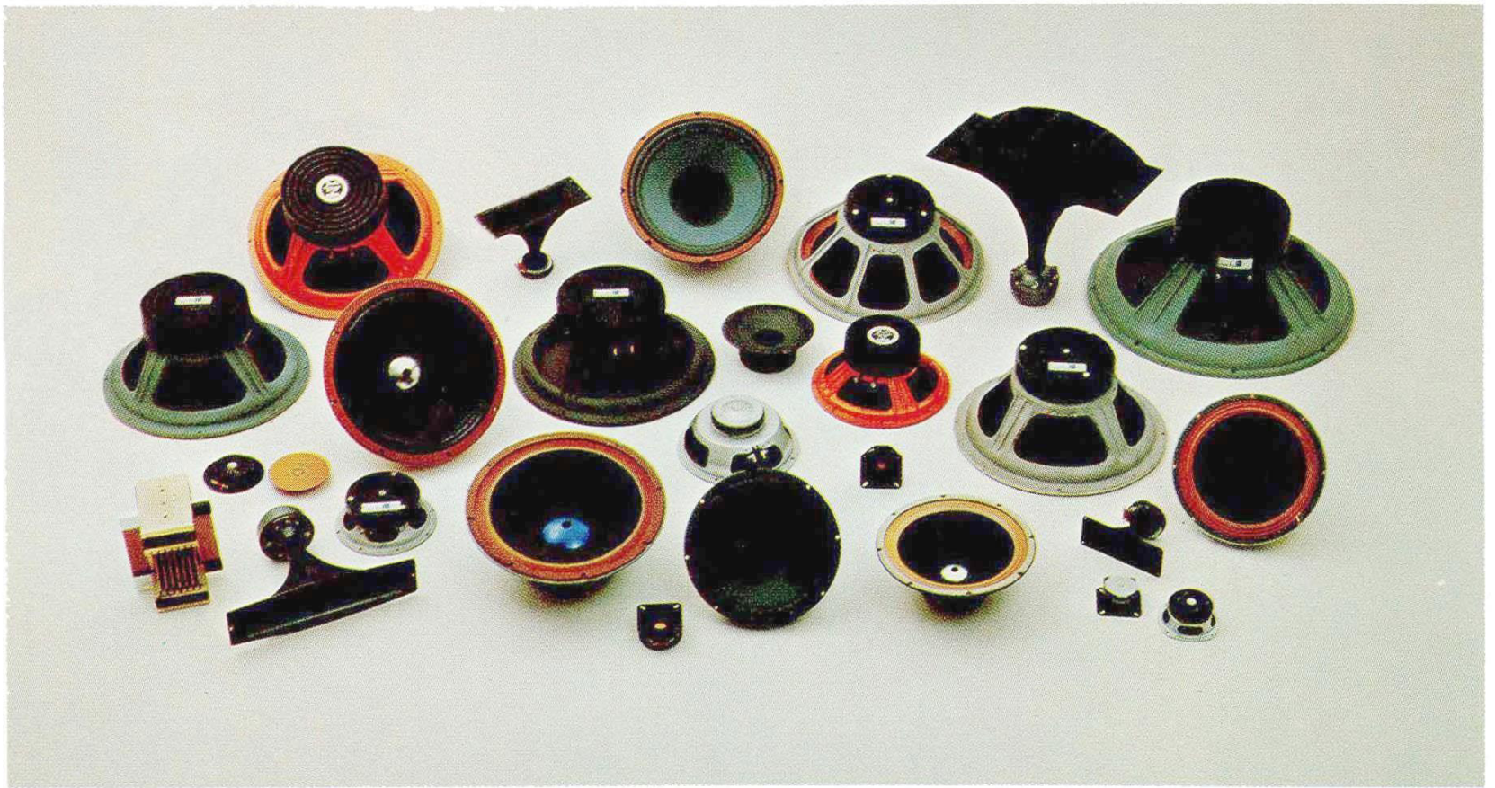
A few of the driver components used in Cerwin-Vega speaker systems. With diameters up to 24 inches and power handling capacities up to 1,000 watts, there is a Cerwin-Vega speaker for just about any application.