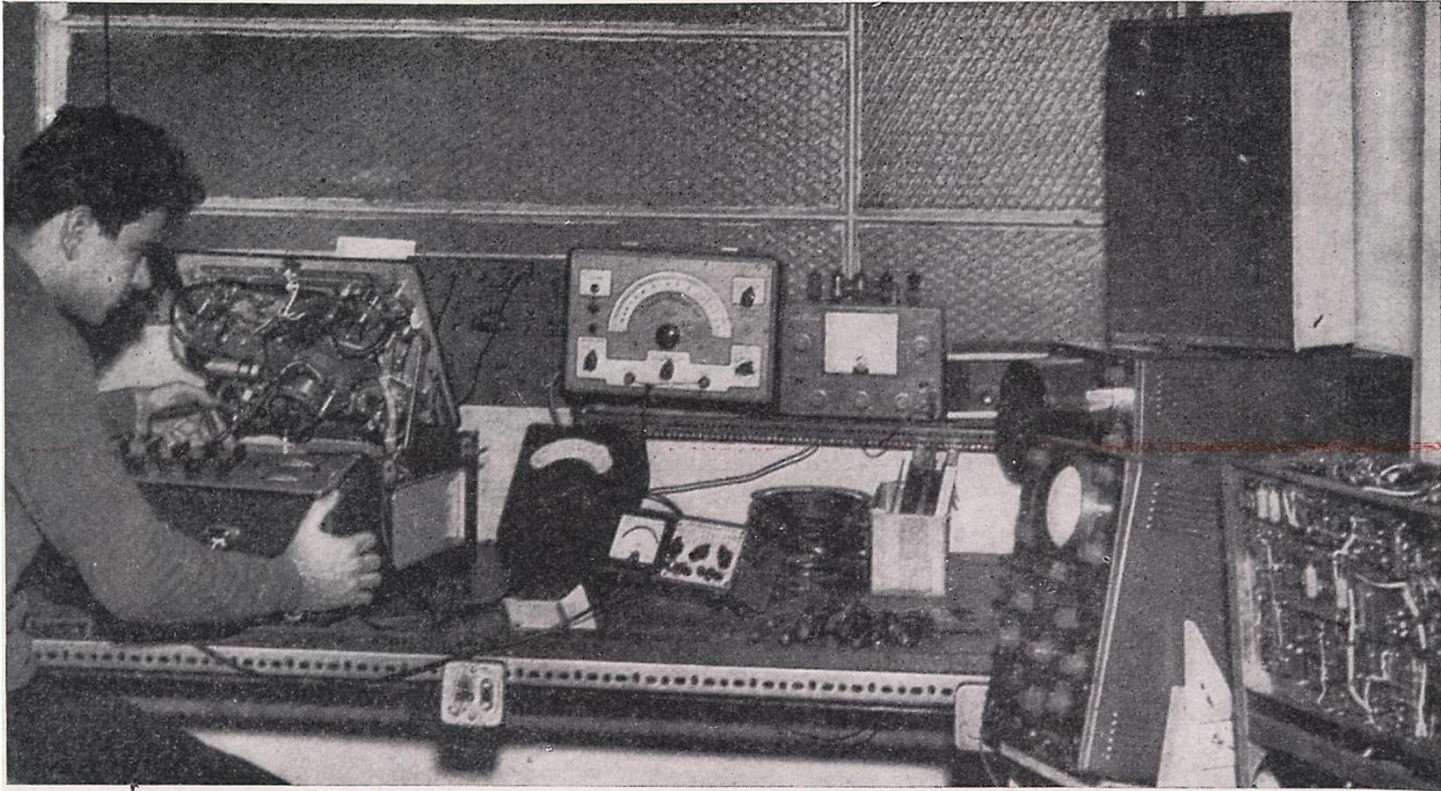
Above: Every machine undergoes a rigorous testing procedure to ensure that it meets the high specification, both mechanically and electrically.