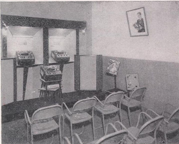
Below: A well equipped demonstration room is at the disposal of dealers and tape club members who wish to examine and have demonstrated the current range of Brenell tape recorders.

amplifiers, but should the unit (comprising deck, recording and replay pre-amplifiers) be required as a complete tape recorder there are available the necessary power amplifiers and speakers for easy installation into the cabinet.