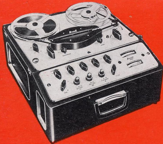
BRENELL STB 2

Right: Skilled fitters who work to the rule "quality before quantity" assembling decks in a corner of the Assembly Shop.