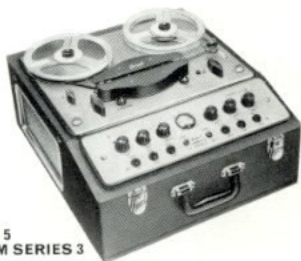
MARK 5 TYPE M SERIES 3

High quality amplifier with power output of 2½ watts r.m.s. and a frequency response of 40–20,000 c/s—can be used independently of tape recorder—narrow gapped record/playback head for extended frequency response—double gapped ferrite erase head to minimise erase noise—head-phone monitoring.