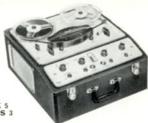
MARK 5 SERIES 3

BRENELL ENGINEERING CO. LTD. 231-5 LIVERPOOL ROAD, LONDON, N.1. Telephone: NORTH 8271 (5 lines)