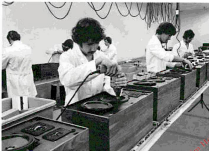
ADS ASSEMBLY LINES IN OUR WILMINGTON, MA PLANT

The ADS 700 is a fine example of systems integration. Whether you buy it for its high-quality components or for the beautiful exterior finish, there is little in its price range that can match the musical performance and at the same time its compact size and efficiency.