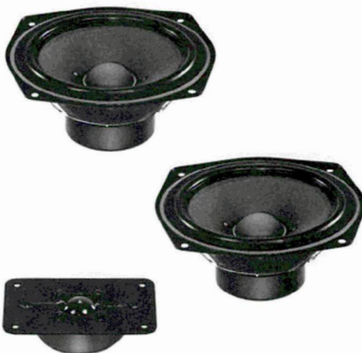
ADS 700 DRIVER COMPLEMENT